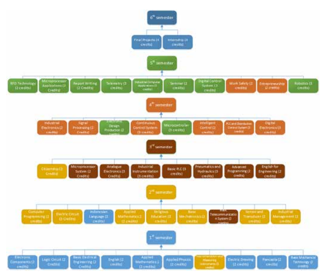
Figure 2. Proposed of Revised Curriculum (Based on Curriculum Evaluation Year 2015)