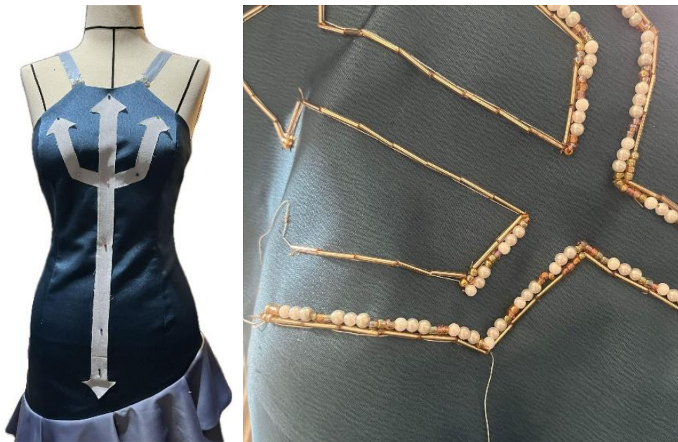
Figure 5. Beading embroidery process on a party dress

The application of bead embroidery in the shape of a trident begins with making a pattern that forms a trident design and then pinning it with a needle on the garment; then, on the outer part of the pattern, the researcher sews according to the pattern that had been pinned. This is done so that the beading embroidery process that will be done next becomes easier, and the desired result is symmetrical and harmonious bead sequence combinations. Then, the next step is to apply beads according to the choice of bead colour and type that have been determined to form the shape of a trident by sewing it, as seen in Figure 5. The beads used are gold-coloured bamboo beads, 4mm pearl beads with three different colours, transparent sand beads that match the colour of bamboo beads, and blue sand beads with other shades, from light to dark blue.