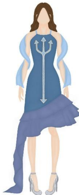
Figure 4. Design (c)

Ideas compiled into the mood board, along with the fashion designs made, are determined, and design (c) is the design that will be created into a party dress. According to Figure 4, the design was chosen because it supports the elements in the mythological