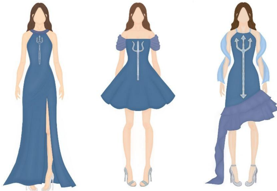
Design (a) Design (b) Design (c) Figure 3. Party Dresses Design Development.