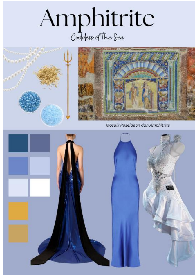
Figure 2. Mood board

Figure 2 is a mood board arranged in accordance with the source of ideas and other components that will support the making of the intended party dress. Components included in the mood board consist of colour selection and the clothing model that will be made into a party dress. This mood board shows a party dress model with the use of fabric and beads that will decorate the front of the dress as a complement to the party dress so that the combination of these two things can represent Amphitrite as the goddess of the sea, which of course needs to have an association with the sea and the things in it which also still heavily related to the primary source of idea, Amphitrite. In addition, a gold-colour trident shown on the mood board will be the main design to be applied with sequence of different types of beads on the surface of the party dress. The majority of colours to be used as the party dress are blue, while gold and a small portion of different shades of blue, along with iridescent white, will be the colours chosen for the beading.