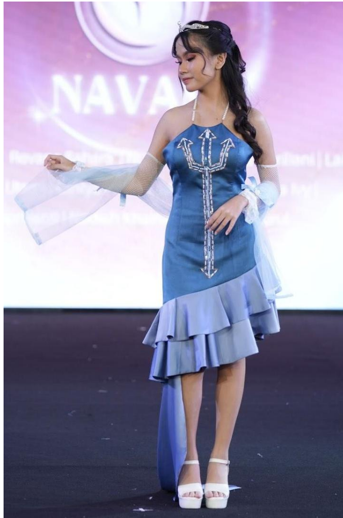
Figure 6. A party dress that has been realized

one elongated part with a graceful fall impression on the right side. When showcasing the dress on a fashion show, as seen in Figure 6, the dress was completed with a crown in the same colour with accessories and millinery such as blue tile fabric as a shawl, high heels, and pearl earrings. The colour of the accessories is gold to further support the luxurious, elegant, and graceful impression of the party dress based on the mythological figure Amphitrite.